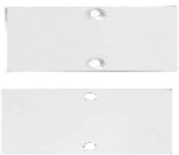
End Cap (Pair) #EC